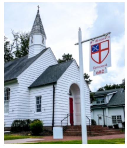
St. Margaret's Episcopal Church, Carrollton, GA