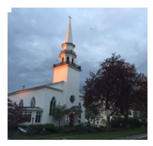
Christ Episcopal Church, Manlius, NY