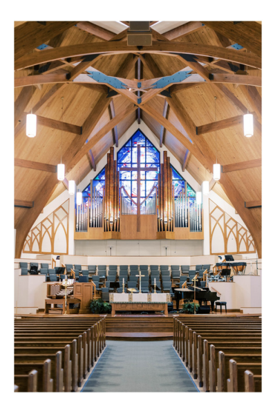
New Center: The Sugar Land Methodist Church

We are pleased to welcome the Sugar Land Methodist Church to our COHI family. Let us know if there is anything we can do for you.