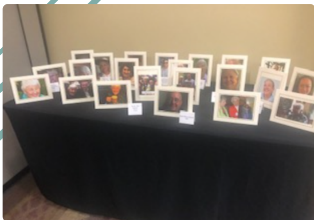
Display of photographs of our Honored Alums.