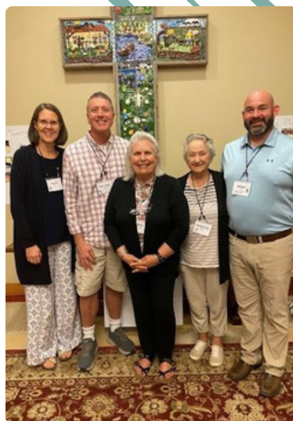
The Little Rock St. James crew!