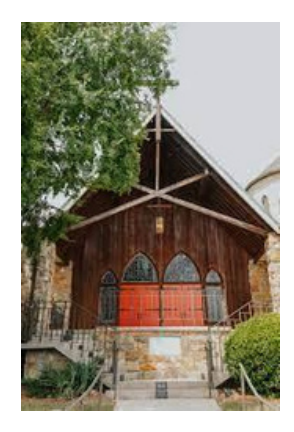
Grace Episcopal Gainesville, GA

Three churches in the southeast region are working together to plan a virtual training which will begin in early January. Representatives from Grace Episcopal in Gainesville, GA, Holy Innocents' Episcopal in Atlanta, and Trinity Episcopal Cathedral in Columbia, SC, are working together to schedule speakers and training sessions on Zoom so that participants from diverse geographic areas can train together. Many of the speakers will be clergy leaders from each of the three parishes.