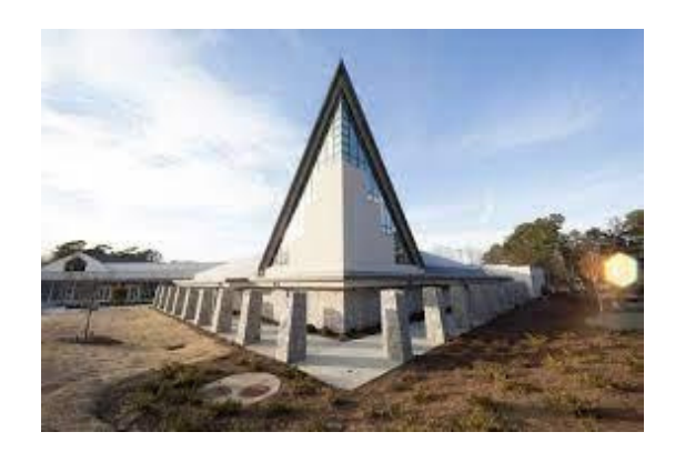
Holy Innocents' Episcopal Church Atlanta, GA