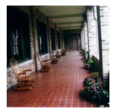
Sisters of Charity Cloister Walk