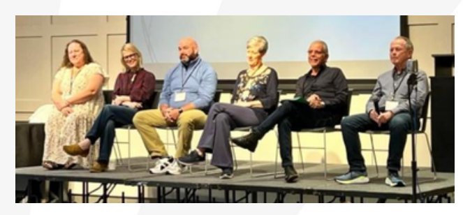
New Board members are introduced and describe their roles.