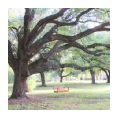
Sisters of Charity Grounds