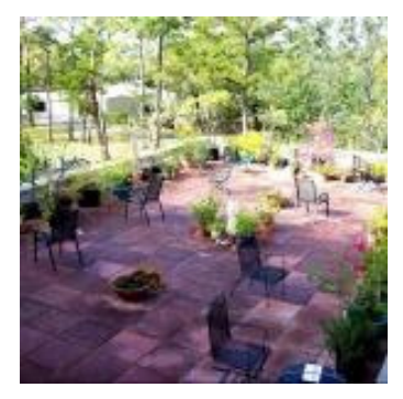
Sisters of Charity Roof Garden