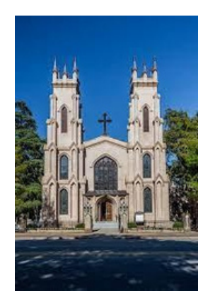
Trinity Episcopal Cathedral Columbia, SC

If your COHI center is small and resources are scarce, consider working with other programs to take advantage of economies of scale and accomplish training for your potential new COHI members.