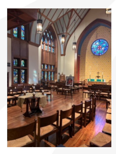
Taize Service in All Saints Chapel